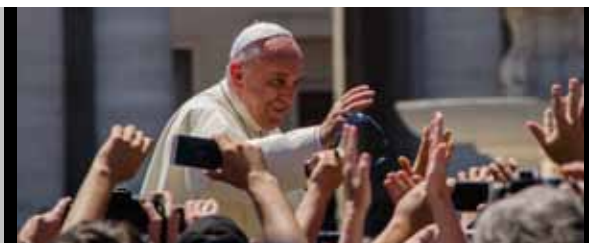
Pope Francis in St Peter's square - Vatican 2014