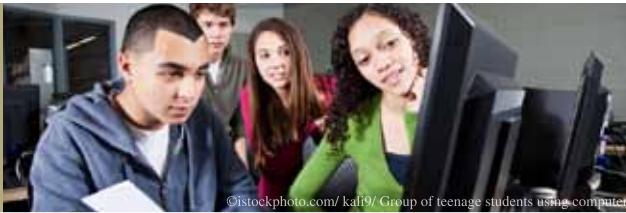
Group of teenage students using computer

Additionally, you can still visit the Acton Website and purchase many of the lectures at Acton University for $1.99 each. Next year, Acton University will be from June 12-15 in downtown Grand Rapids.