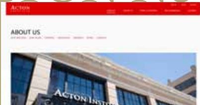
The new Acton website will be more mobile-responsive and simplified.