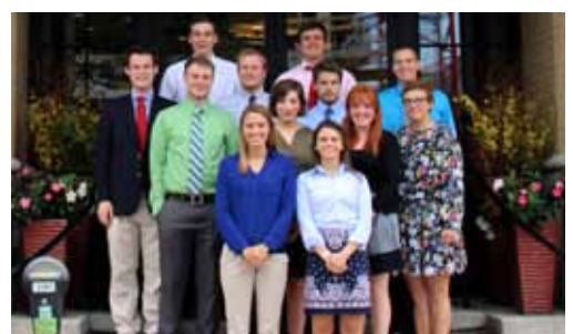
Summer 2016 interns

We began this process in mid-2015 with a deep study of how Acton.org users interact with the site, which now numbers more than 4,000 unique pages. When the site launches before the end of 2016, there will be a platform that showcases the content from Acton experts in a much more engaging, easy-to-use way. Navigation will be simplified, and the pages will have a brighter, more graphic look.