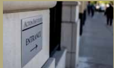
Acton is leading the free-market movement.