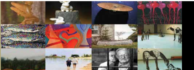
Acton welcomed 11 pieces to its lobby during Artprize 2017.

For more information about all the artists shown in the Acton building, visit acton.org/artprize .