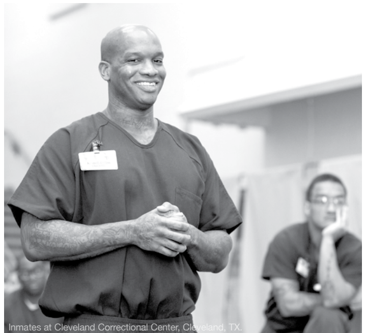
Inmates at Cleveland Correctional Center, Cleveland, TX.