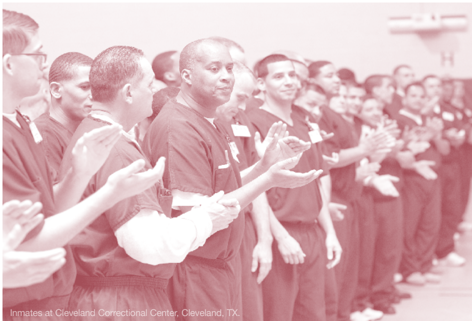
Inmates at Cleveland Correctional Center, Cleveland, TX.

Sure. It is not at all uncommon for guys to have a misunderstanding about what PEP really is intended to provide—being a hand up, rather than a handout. When they first get a postcard that basically says, "So, you want to be an entrepreneur?" their immediate thought, in some cases, leans towards entrepreneurs who are fabulously wealthy. It's almost like they think they're being asked, "Do you want to be a millionaire?" They think it's going to be all about business and how to