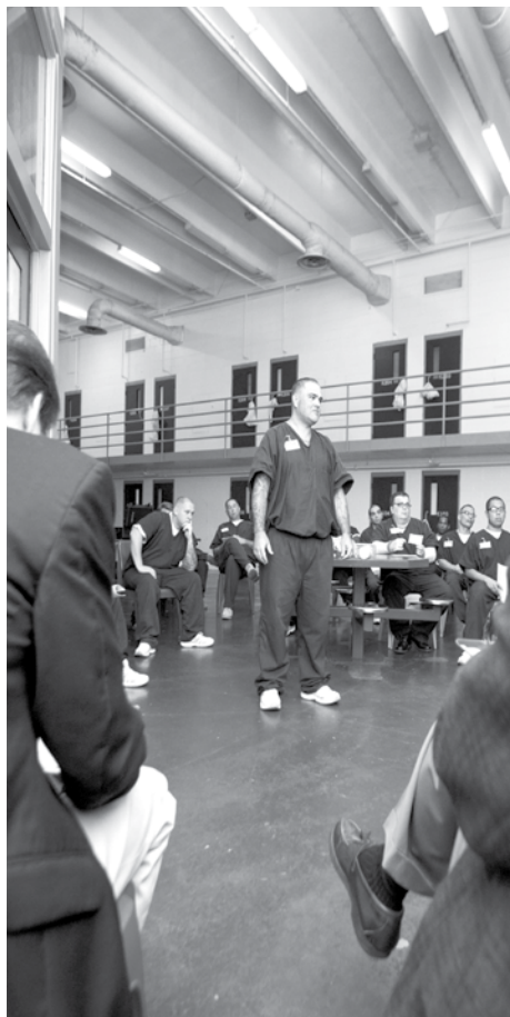
Inmates at Cleveland Correctional Center, Cleveland, TX.

It is easy to forget you are inside a prison while attending a PEP event, but in the afternoon we are interrupted several times