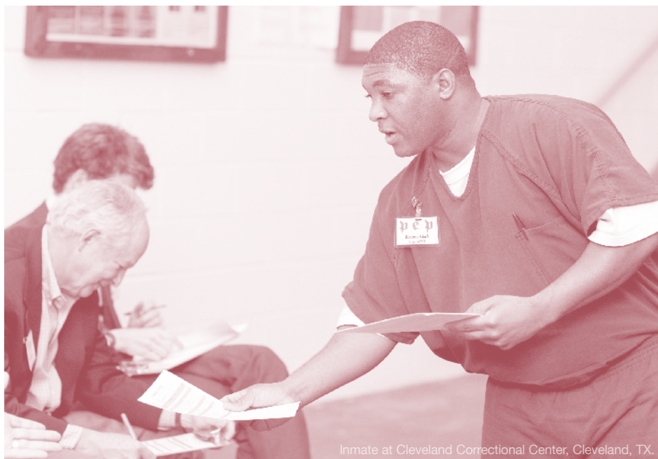
Inmate at Cleveland Correctional Center, Cleveland, TX.

PEP also boasts of a low recidivism rate. After three years, less than six percent of PEP graduates are repeat offenders, compared to 23 percent of non-PEP graduates. To be eligible for the program inmates must not be incarcerated for a sex crime, must be within three years of release, and must possess a high school diploma or GED, all while making a commitment to change.