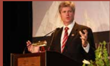
Jeff Fortenberry speaking at the 22nd Annual Acton Dinner.