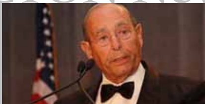
Mr. Richard M. DeVos accepting the Faith and Freedom Award