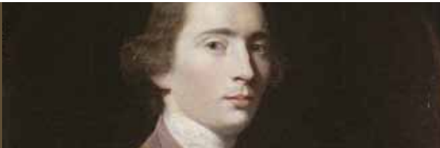
Charles Carroll of Carrollton