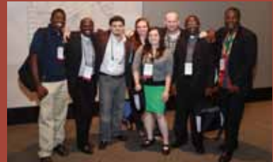
AU attendees from around the world.