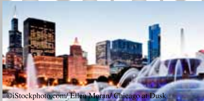
Chicago at Dusk Buckingham Fountain and the Chicago skyline.