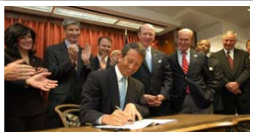
Governor Mark Sanford

Institute's "Philanthropy and Human Rights: Creating Space for Caritas in Civil Society" and "Finance, Globalization and Morality: Twenty-First Century Challenge," held last year in Rome. These conferences assured [us] that Christian love lives on in the market economy . . . and with particular consideration for the poor. The market is a sure means for global human development.