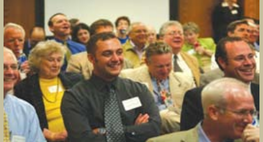
A sold out ALS audience on May 17