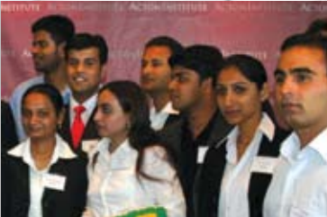
MBA students from Punjabi University, India