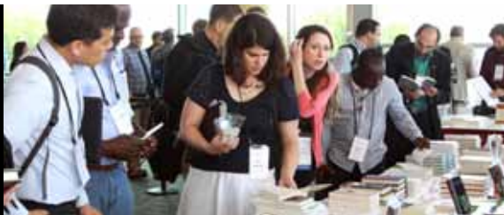
Attendees at the Acton University bookshop.

If you're interested in hearing any lectures, class sessions, or dinner keynotes from Acton U, please visit http://sites.fastspring.com/acton/product/actonuniversity2015 .