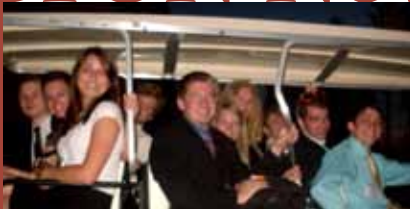
The Acton summer interns for 2011