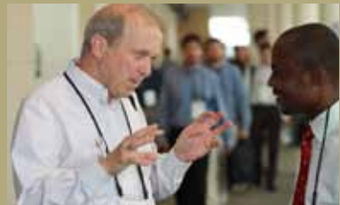
Acton University participants