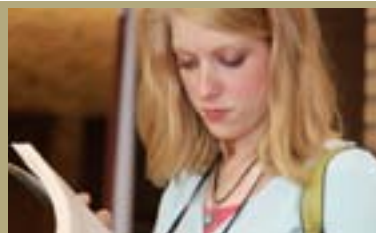
Acton University had over 800 applications this year