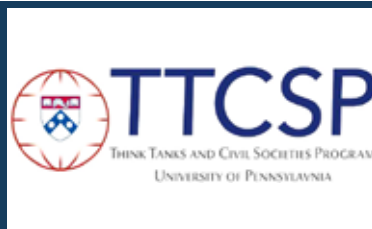
The TTCSP has ranked Acton in top spots in numerous categories.