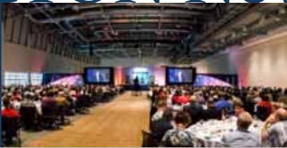
In 2014, Acton University had nearly 900 attendees.