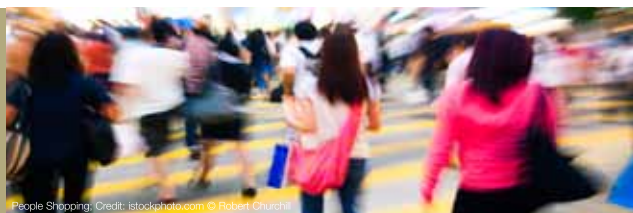
People Shopping.