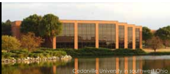
Cedarville University in southwest Ohio

The day concluded with a dinner attended by Cedarville administration and professors for the Bible, Business and Economics department discussing the day’s content and how this could be integrated within the University.