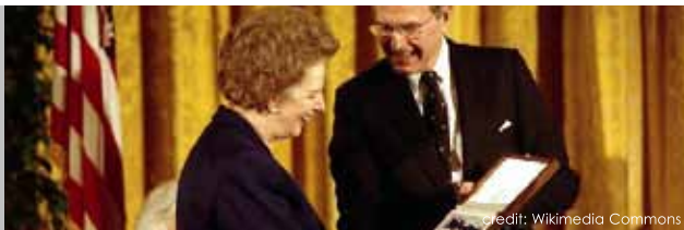
Thatcher awarded the Presidential Medal of Freedom.

The Acton Lecture Series began in 1991 as a service to the local community. Acton seeks to bring knowledgeable and thought-provoking speakers to the area, providing our local audience in Grand Rapids, MI, the opportunity to interact with prominent thinkers on issues of faith and freedom.