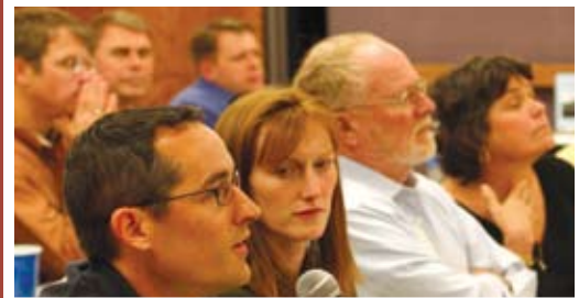
Acton Lecture audience participants asking questions