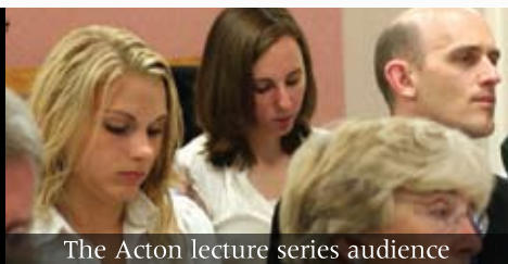
The Acton lecture series audience