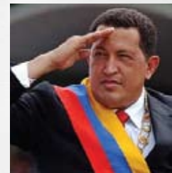
Hugo Chavez suffered his first electoral defeat