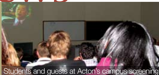
Students and guests at Acton's campus screening

Freedom and the Catholic Bishops' Conference of the Philippines. On November 10 Acton's co-founders held a discussion with the Brotherhood of Christian Businessmen and Professionals. To date, the BCBP can be found in 113 strategic business centers in the Philippines, covering thirty seven provinces and thirty eight dioceses. There are fifty one full chapters and sixty two outreaches in the Philippines and two outreaches in California.