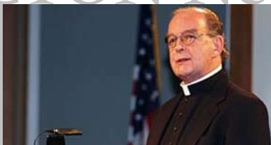
Fr. Richard John Neuhaus