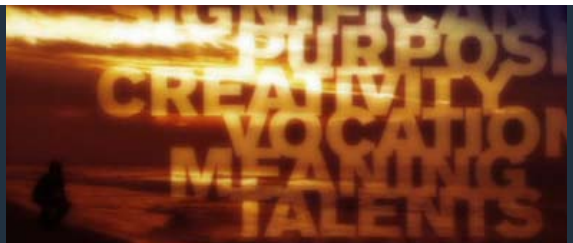
A Screenshot from The Effective Stewardship

“...Christian stewardship touches every aspect of our lives.”