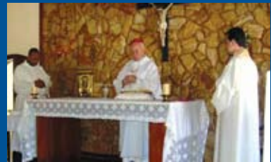
Brazilian Bishops at Acton FAVS