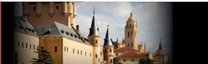
Alcazar And Cathedral Of Segovia, Spain