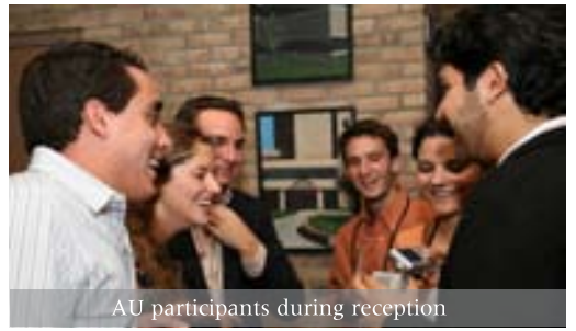
AU participants during reception